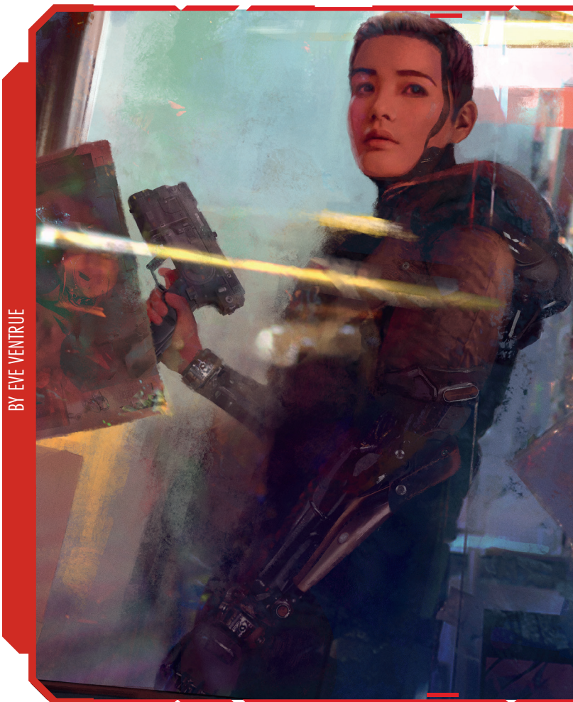
BY EVE VENTURE

And that's ten unique campaign ideas. Feel free to use them in your own games, or let them serve as inspiration for something new! Remember, you never need to stick to the status quo. Find your own way to fight back in Night City!